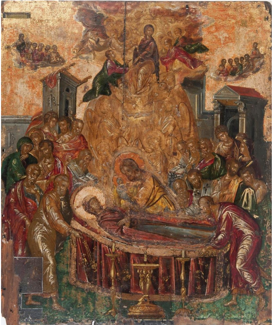
[The Dormition of the Mother of God, 1565-1567 by Domenikos Theotokopoulos. Holy Church of Koimisis tis Theotokou, Ermoupoli, Syros. ]